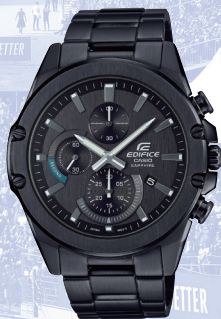
EFR-S567DC-1AV Black ion plated case and band Stainless steel band