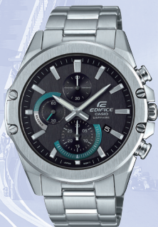
EFR-S567D-1AV Stainless steel band