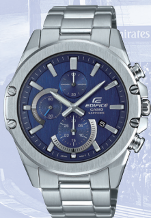
EFR-S567D-2AV Stainless steel band