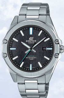
EFR-S107D-1AV Stainless steel band