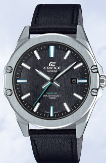
EFR-S107L-1AV Genuine Leather Band